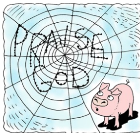
Charlotte's Web Revisited